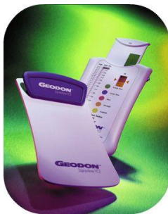
BMI Calculator Clipboard