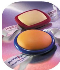
Injection Simulator Pads

HEAT Inc., also specializes in developing motivational ADHERENCE and COMPLIANCE aids, including starter kits and secondary medication packaging.