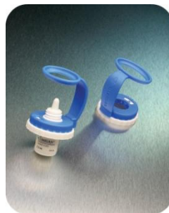
Eye Dropper Compliance Aid