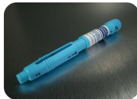
Injection Simulator Pen

HEAT Inc., develops the tools that help pharmacists COUNSEL patients effectively, from Glaucoma Screening Calculators to Diabetes Foot Screening Devices and injection simulators.